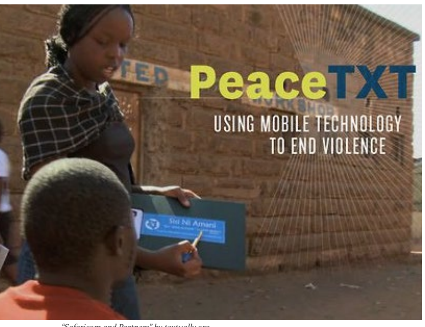
"Safaricom and Partners" by textually.org.

Some of the specific cases include a discussion on the role of private sector actors in Kenya in stopping and preventing postelection violence (ch. 5). In this case, actors including the local private sector association, as well as powerful individual companies, engaged in a coordinated campaign of private diplomacy and public messaging to help prevent conflict. Other chapters include descriptions of the role of business leaders in protecting civilians exposed to atrocity (ch. 3), and examinations of how telecommunications firms (ch. 7) and extractive companies (ch. 6) are particularly central to questions of atrocity prevention.