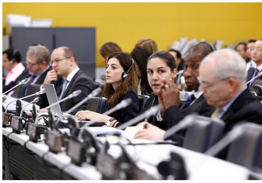
Audience at the General Asembly debates on the Responsibility to Protect.

The field of atrocity prevention took a significant step forward in the mid-2000s with the formal commitment of UN member states to the eradication of atrocities under the framing of the Responsibility to Protect. This commitment was formally adopted by UN members through the outcome document of the 2005 UN World Summit, and has been carried forward by Secretaries-General since then. The specific framing of the R2P commits member states to the eradication of atrocity crimesgenocide, ethnic cleansing, war crimes, and crimes against humanity—both within their borders and in other states. It is built around three pillars of action and commitment by member states: to prevent atrocities in their own territories, to assist other governments in meeting their obligations to prevent atrocity, and to take "timely and decisive action" to end atrocities occurring when