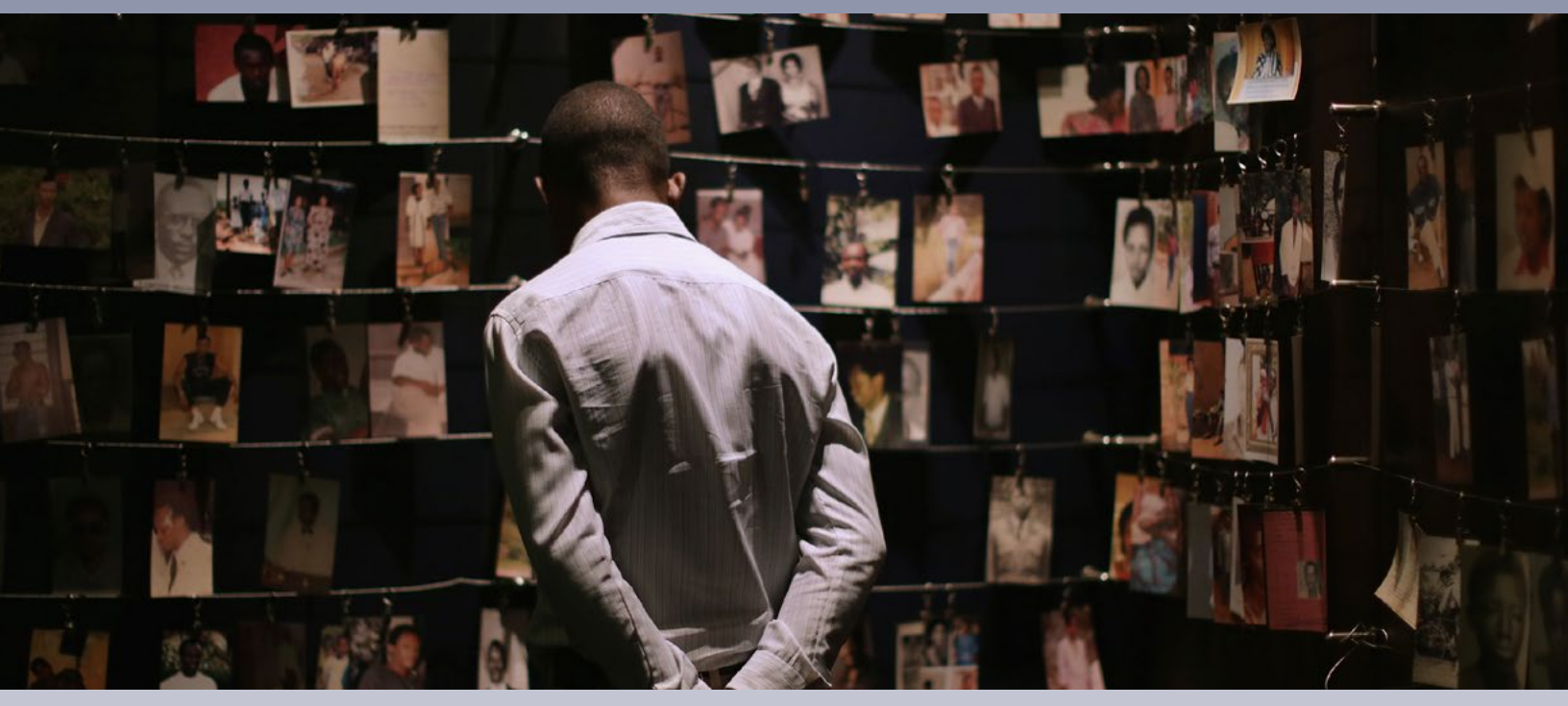
This policy brief, based on a book edited by One Earth Future researchers and fellows, explores the role of businesses as potential allies in supporting the Responsibility to Protect (R2P) principle.