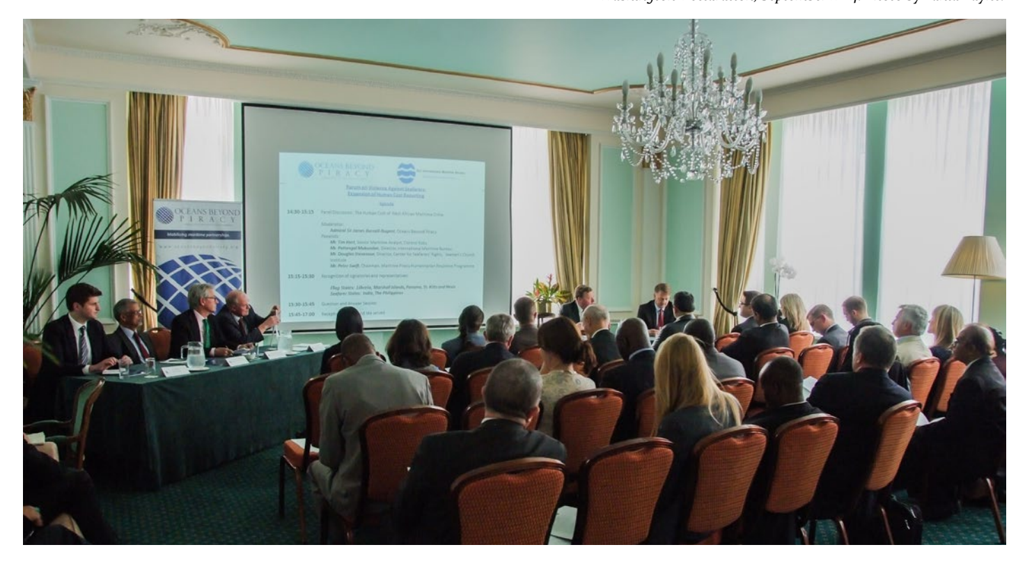
Below: London event condemning violence against seafarers in support of the Washington Declaration, September 2014.