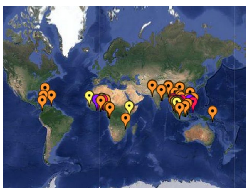
International Maritime Bureau Piracy and Armed Robbery Map 2015, https://icc-ccs.org/.

In the first case, there have been several shifts in security studies and practice supporting engagement with nonstate actors. As the drivers of violence internationally have shifted away from major stateto-state conflict and toward substate conflicts and violence driven by nonstate actors, there has been a corresponding shift in discussing security in broader terms such as "soft" or "human" security challenges.<sup>1</sup> This definition encompasses issues such as substate violence, terrorism, and state stability, and the diagnoses and solutions to these challenges necessarily involve nonstate actors more directly than traditional definitions of security focused on military conflict. Alongside this shift, there has also been a shift in institutional structures used to address international security challenges. There has been a proliferation of network-based structures as compared to more traditional hierarchical and treaty-based structures.<sup>2</sup> These