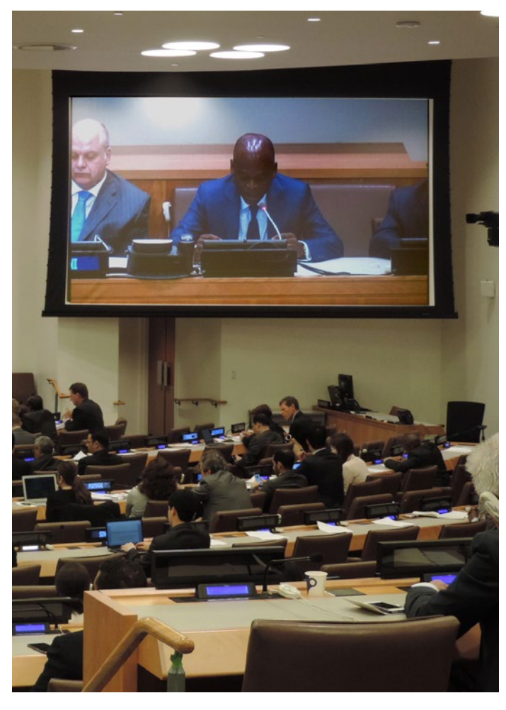
Above: HEM Robert Dussey, Minister of Foreign Affairs for the Republic of Togo, speaking at the CGPCS Plenary Meeting, July 2015.

The chapter also acknowledges the controversies associated with bringing private-sector actors into security discussions, including the criticism that state and legal institutions are the only legitimate institutions to address security issues, and resistance from private-sector actors to engage in activities other than their core businesses. However, despite this criticism the cases provided here suggest that there is a distinct role for nonstate actors to extend the capacity and abilities of existing security institutions.